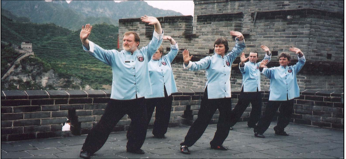
Tai Chi - Chi Kung on the Great Wall